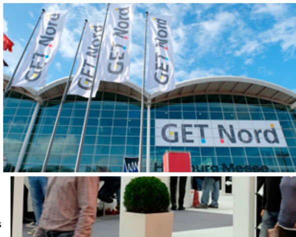
Visitor turnout was high at the event and at Doepke's stand in Hall B5: the GET Nord was a resounding success

"We are delighted that everything went so well. With its unique concept of rigorously networking different branches, trades and products, GET Nord reflects market developments in the field of technical building equip-