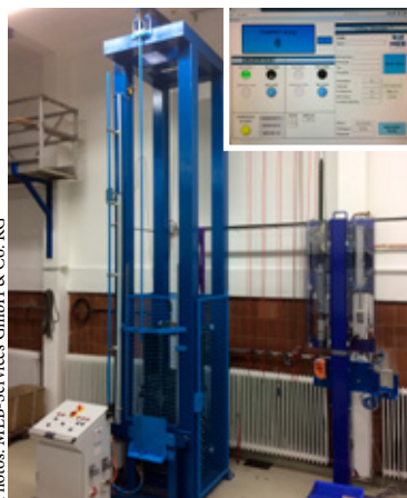
Test rig and visualisation function: cable winch testing with DCTR support