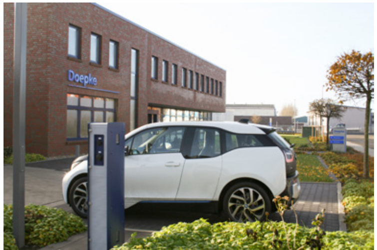
The latest addition to the Doepke vehicle fleet parked in its designated charging spot

Last November an electric vehicle also joined the Doepke fleet. Fully charged, the vehicle is able to travel just under 200 km and is thus mainly