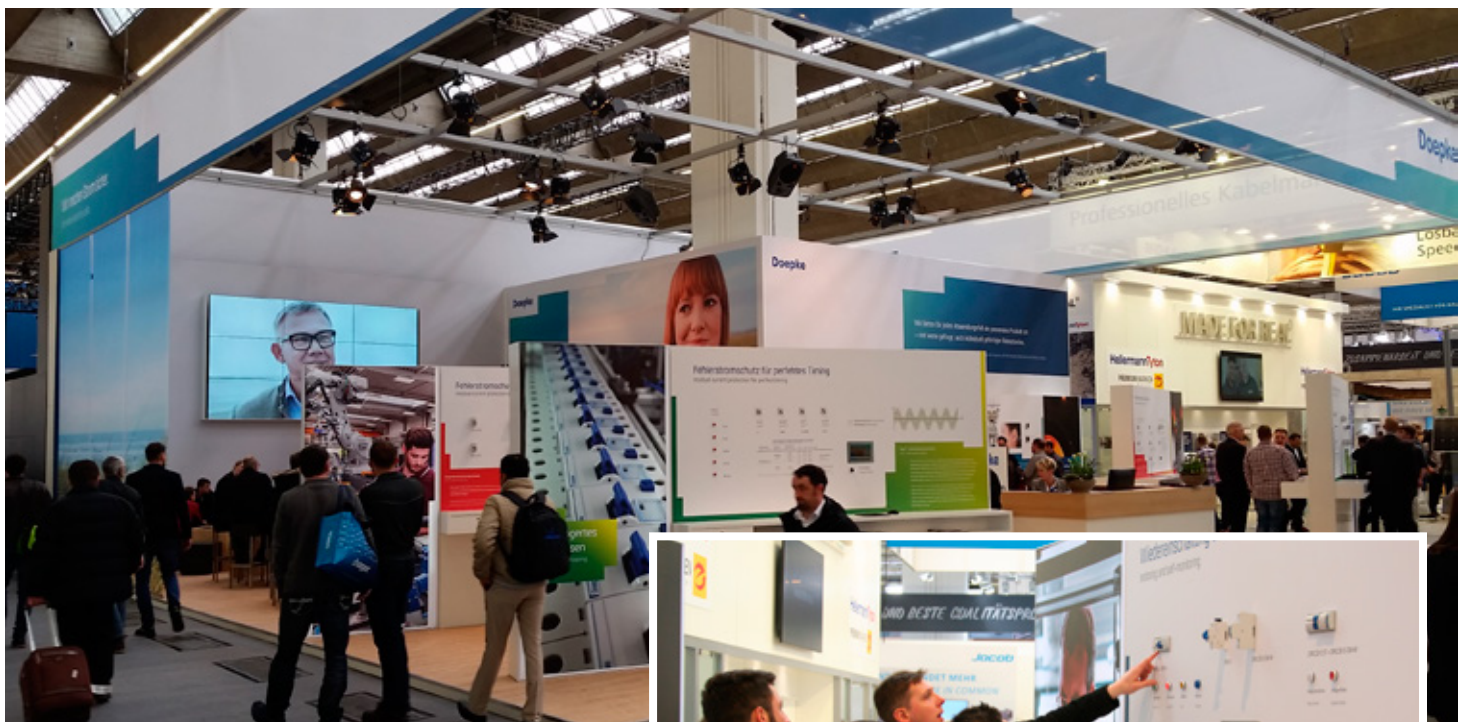
Well attended, with a clear layout: our stand at Light + Building 2018 showcased our new look